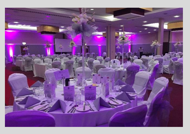
Private Dining options from 10 – 300 guests.