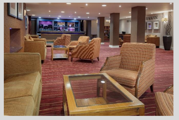
Lounge Bar – Available for Private Drinks Reception's & Self-Service conference cafe.