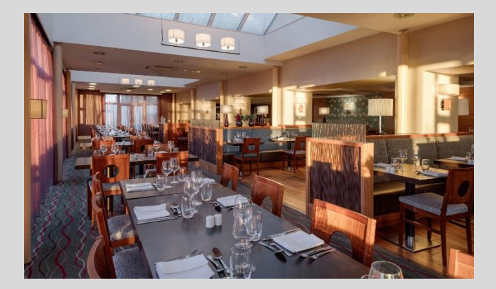
1779 Restaurant – Serving Full Breakfast, Conference Lunches and Evening Meals