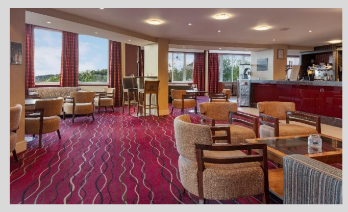
1779 Bar – Serving Beverages and Bar Meals