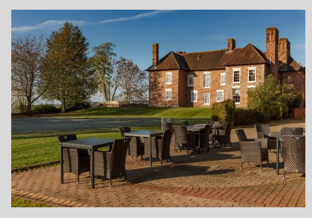
Gorge Bar and Terrace – Located off the 18<sup>th</sup> Hole and serving Beverages, a Light Bites Menu and Afternoon Tea.