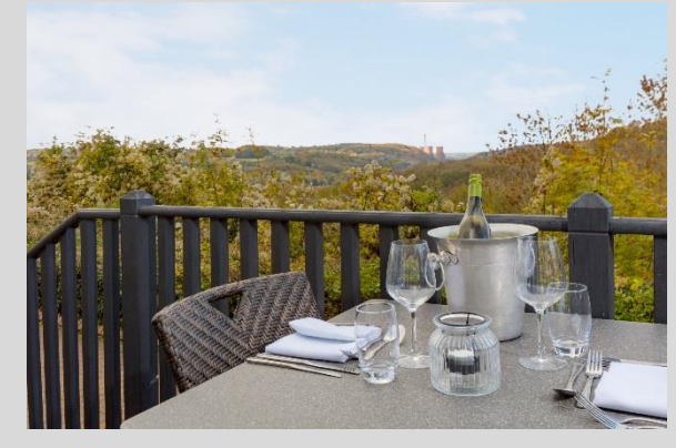
1779 Terrace – Available for al fresco dining, drinks receptions or private BBQ's